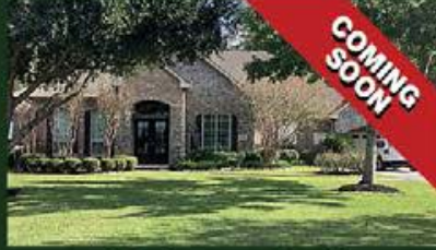
4 Bedroom • 3 Bath Quiet Cul-de-Sac Lot in Weston Lakes No Rear Neighbor