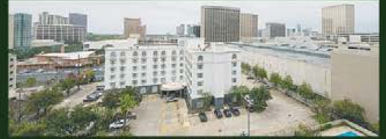
5150 Hidalgo #903 in Houston Hi-Rise Condo • 1,370 s.f. • 2 Bed/2 Bath $304,000