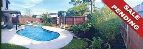
10710 White Oak Trace • Cypress 2,812 s.f. • 4 Bed / 2.5 Bath with Pool