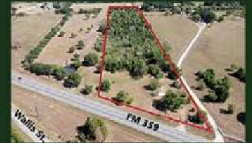
7511 FM 359 6+ Acres in Fulshear Commercial Property $4,621,280