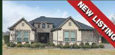
32818 Wall Flower Beautiful Finishes in Weston Lakes 3 Bed / 2.5 Bath / Generator Corner Lot