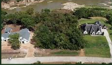
Rare Brazos River Lot 1.43 Acres • 3019 Wellspring Lake $459,119